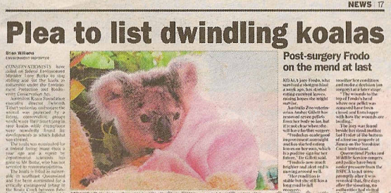
SEE YOU LATER: Australia Zoo carers release Frodo after her recovery from shotgun wounds; and (inset) how The Courier-Mail covered Frodo's plight.